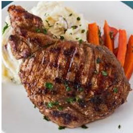
Center Cut & Poterhouse Pork Chops

Quality Meats. Humanely Raised. Sustainably Sourced.