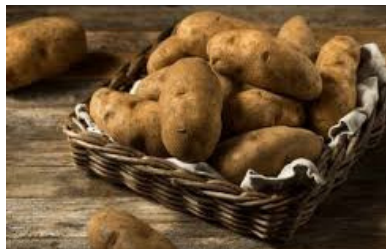
Organic Russet Potato - 3 lb bag