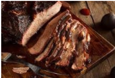
Pasture Fed Beef Brisket