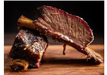
Pasture Fed Beef Short Ribs