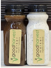
House Made Dressings all varieties