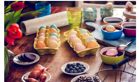
Watkins Assorted Food Coloring - 4 pk