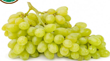
Organic Green Grapes