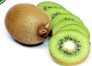
Organic Kiwi - 1 lb