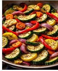
House Made Sauteed Vegetables