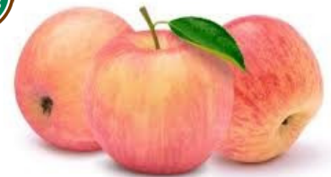
Organic Fuji Apples - 3 lb bag